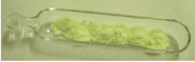
Appearance at Visible Light: